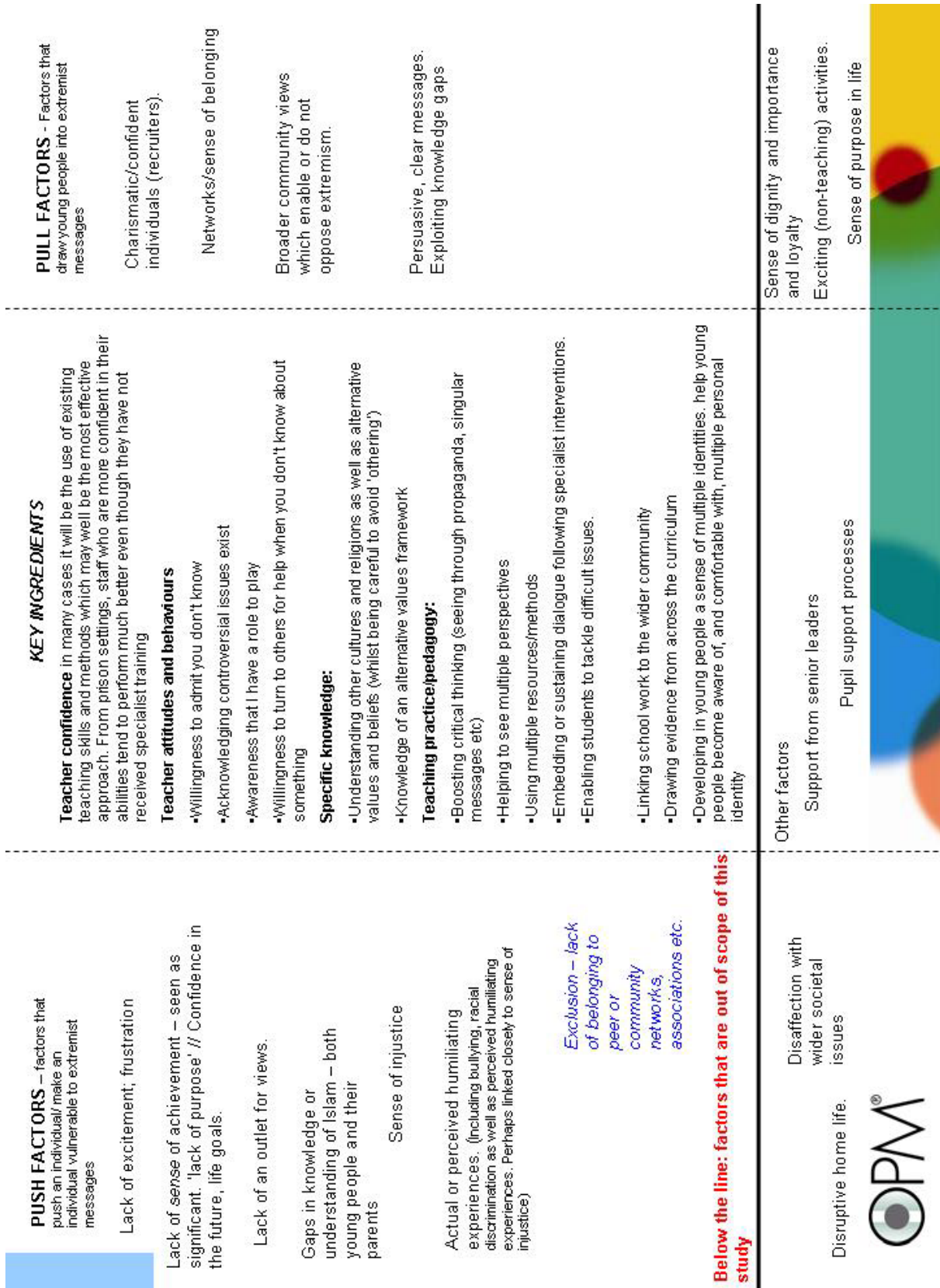
Source: Teaching approaches that help build resilience to extremism among young people, DfE 2011